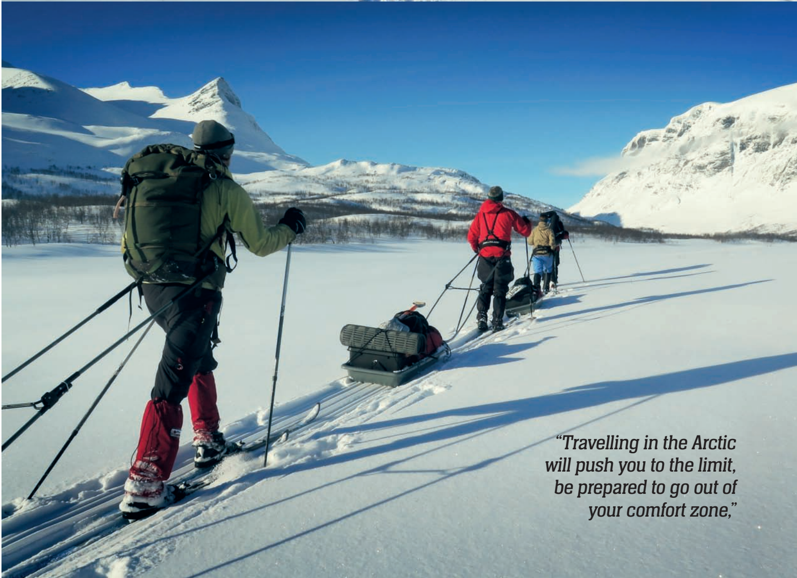
“Travelling in the Arctic will push you to the limit, be prepared to go out of your comfort zone.”