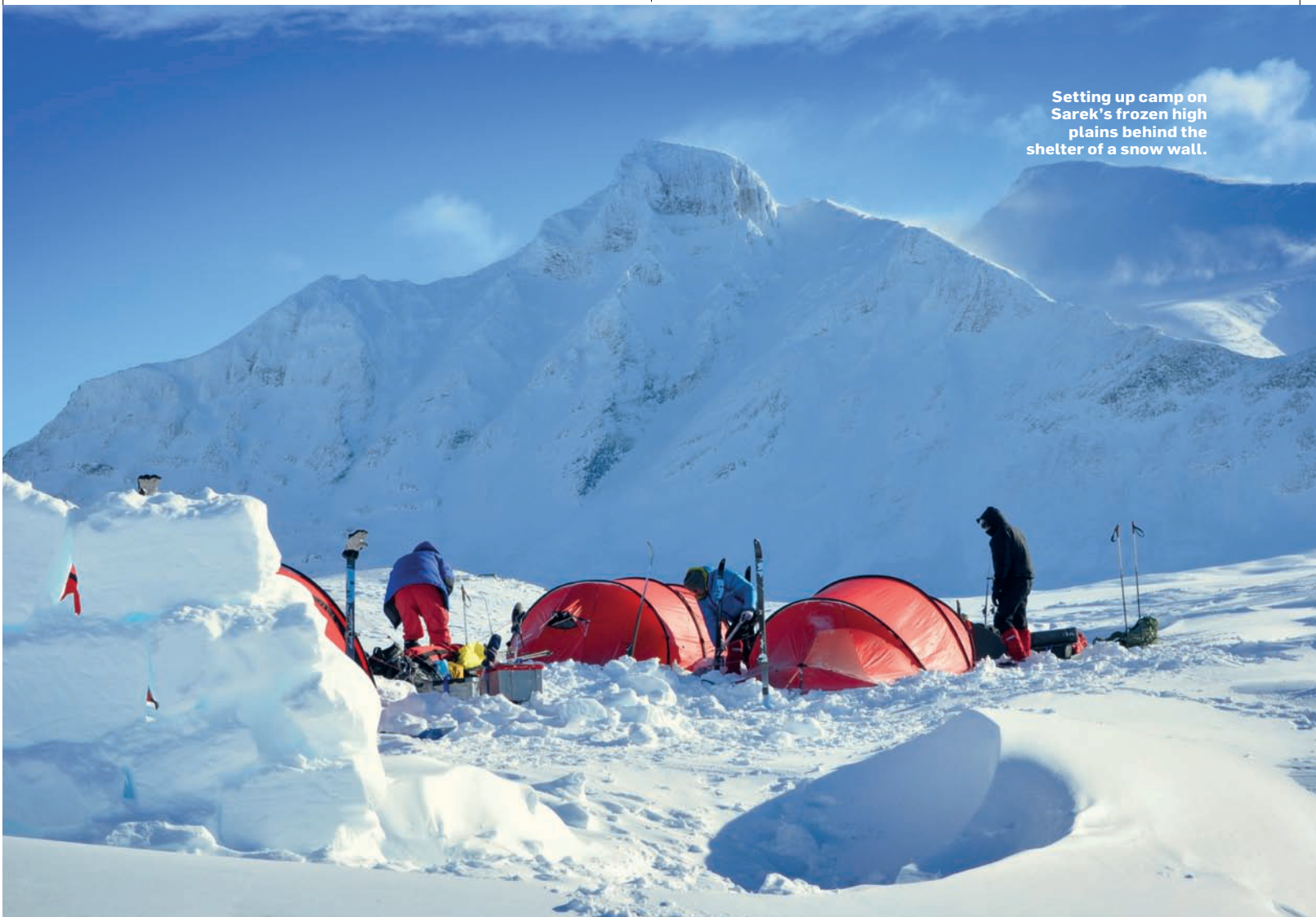
Setting up camp on Sarek's frozen high plains behind the shelter of a snow wall.